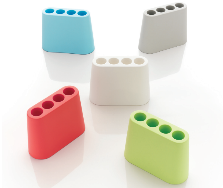
Portaombrelli | Umbrella stand | Schirmständer Porte-parapluies | Portaparaguas