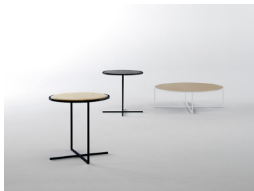
HOLY DAY table