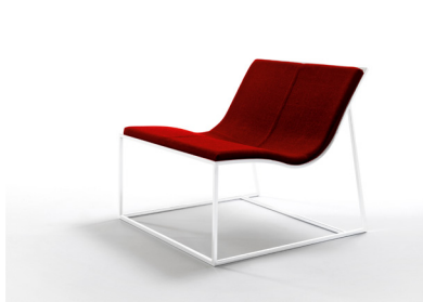
HOLY DAY armchair